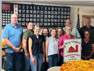
Heavner Farm Pendleton County Sesquicentennial Farm 150 years