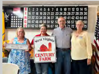
Little Em Cattle Company Hardy County Century Farm 100 years