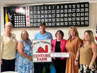
McCauley Back Acre Farm Hampshire County Century Farm 100 years