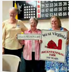
Legacy NELSON Land Pendleton County Bicentennial Farm 200 years